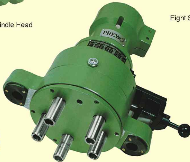
Five Spindle Indexing Multi-Spindle Head