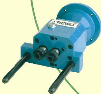
Two Spindle Fixed Multi-Spindle Head