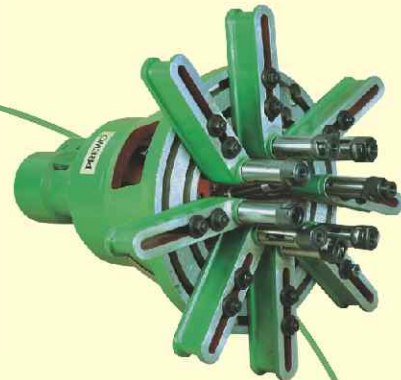
Eight Spindle Adjustable Multi-Spindle Head