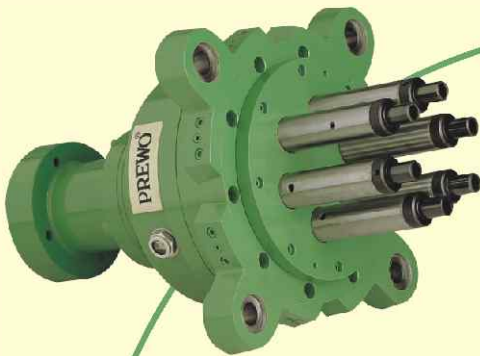
Eight Spindle Fixed Multi-Spindle Head