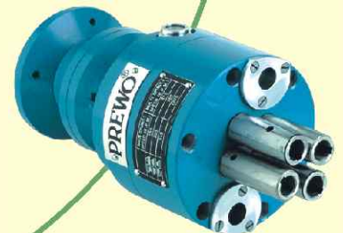
Four Spindle Fixed Multi-Spindle Head